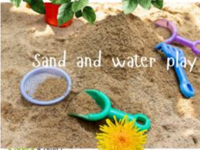
Sand and water play