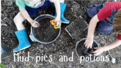
Mud pies and potions