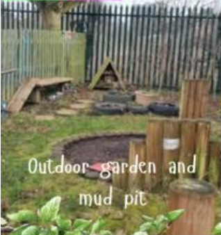
Outdoor garden and mud pit

Mondays 10-11am Lighthorne Heath CFC 0-5years